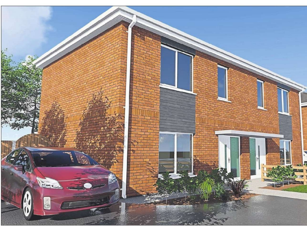
How the homes, which are being built more than 200 miles away, will look once they are in place in Wolverhampton

these nomes could not be built in the tradi-tional way using local labour and materials. "These just look like flat-roofed boxes. 'It's very much going back to the days of cheap, bog-standard council housing - it's a regressive step." The council will remain the owners of the properties, which will be managed by Wolverhampton Homes.